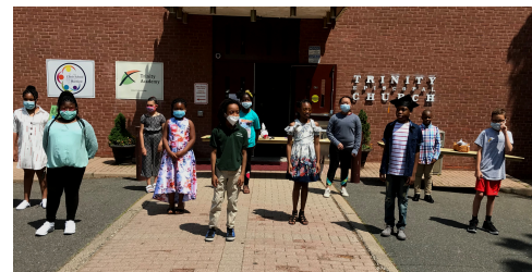
Our Graduating 4th Graders!