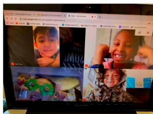
The Bright Smiles Our Teachers See Everyday On-Line!